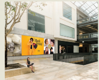
4k UltraHD: 163"-325"