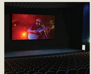
8k XUHD: 325"