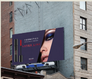
Outdoor 16:9: 230"-578"