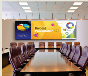
2k FullHD: 81"-217"