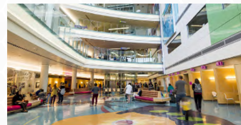
Children's Hospital of Colorado | Aurora, CO