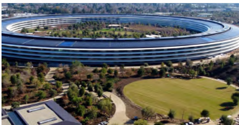
Apple Headquarters | Cupertino, CA

RESOURCES | More than 500 trained and specialized staff, ready to assist. (70+ engineers & programmers, 52 project managers, 35 job superintendents and 100+ installation technicians).