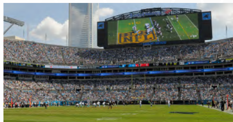
Bank of America Stadium | Charlotte, NC